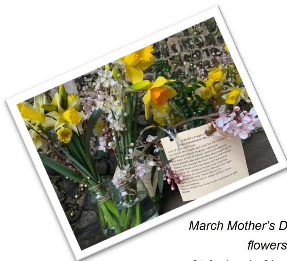
March Mother's Day flowers at St Andrew's Church