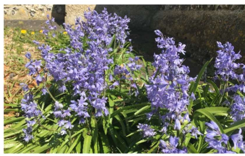
April Bluebells at St Andrew's Church