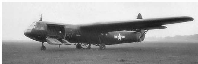
Horsa glider at Welford, May 1944

The airfield itself took 3 years to build and came into service in 1943. It was used from that year and a huge number of allied gliders were towed for the D Day landings, the WACO (USAF) gliders were taken by Douglas C-47 Skytrains ('Dakotas') and the Horsa's (UK) by mainly Halifax and Albermarles converted from 'bomber duties'.