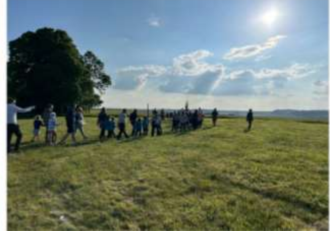
Chaddleworth News page 11 August 2024